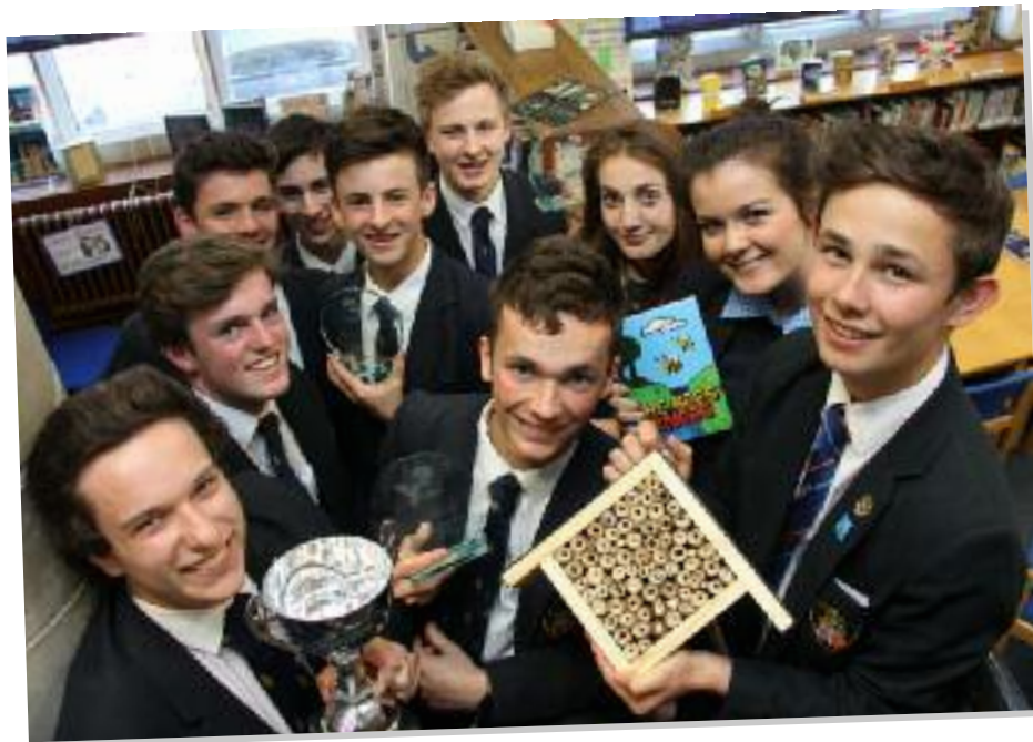
Buzzing: Team Revelation with their trophies from the North Yorkshire round of Young Enterprise