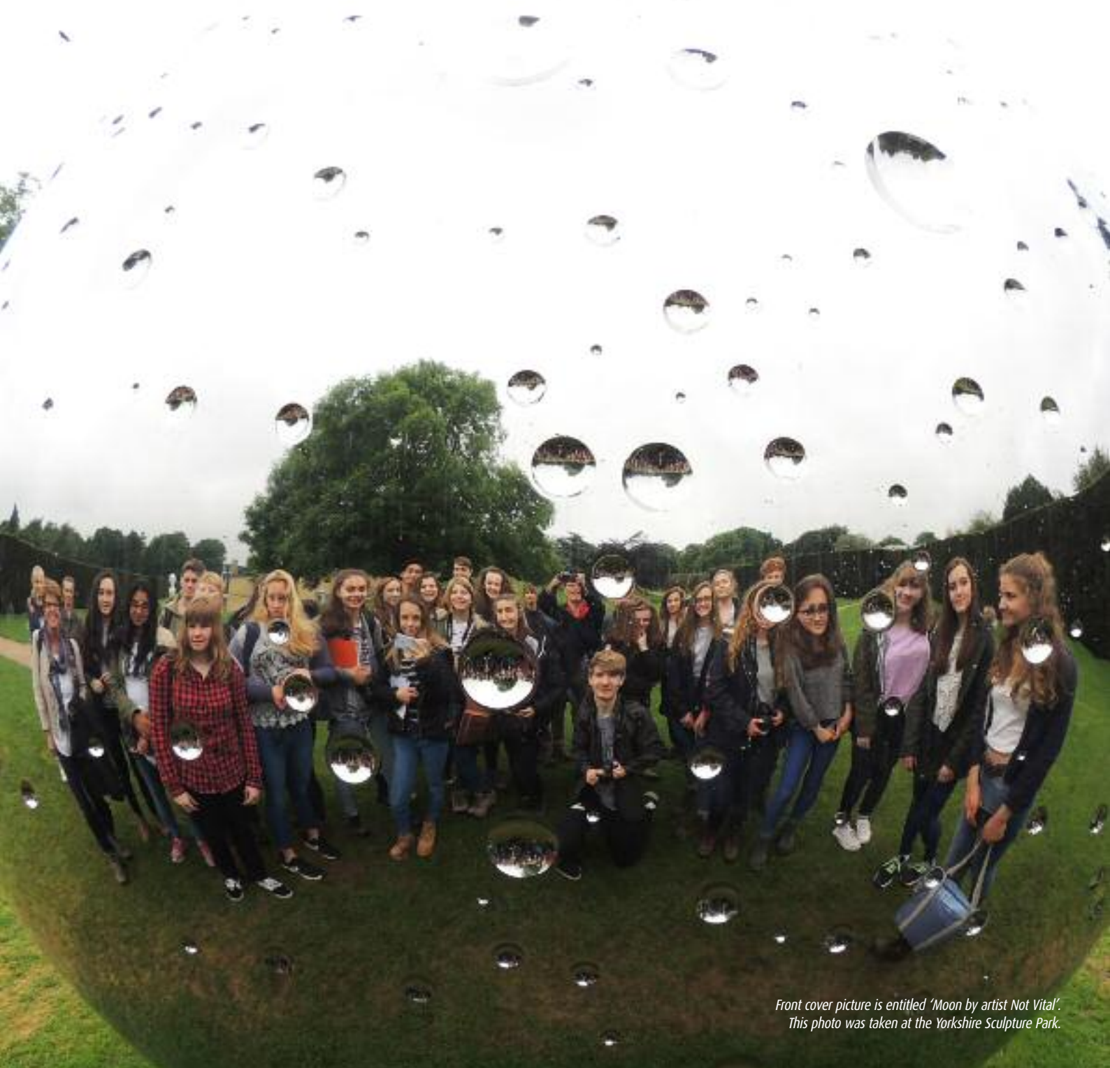
Front cover picture is entitled 'Moon by artist Not Vital'. This photo was taken at the Yorkshire Sculpture Park.